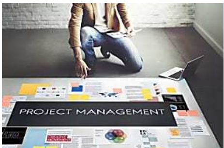
Enroll for short term Project Management Certification from XLRI Talentedge