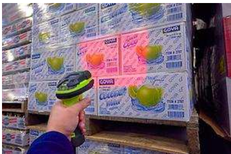
How do you improve productivity and production line efficiency in the warehouse? Find out other benefits in Zebra's Zebra Technologies