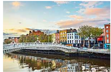
The Downside of Dublin's Hot Market: Sellers Can't Meet High Demand Mansion Global