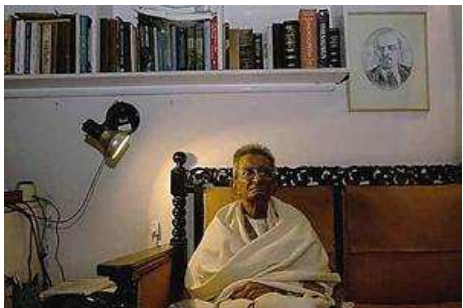
'I Am Very Hopeful About The Left Even In The US'