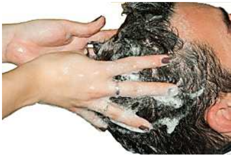
Simple Method "Regrows" Hair (Try Tonight) en.dailyhealthclub.co