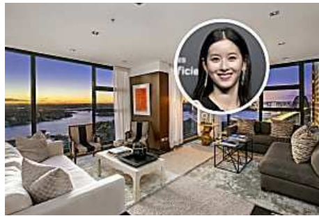
China's Youngest Female Billionaire Selling Sydney Pad for A$18 Million Mansion Global