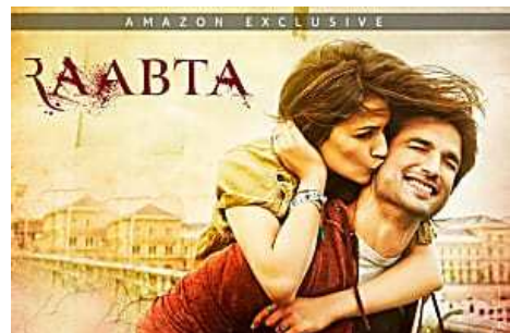
Watch Sushant Singh Rajput & Kriti Sanon Starrer Raabta Now! Amazon Prime Video