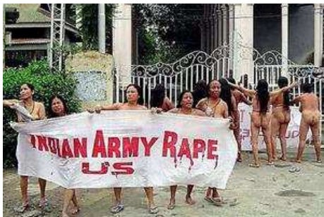
'Indian Army, Rape Us'