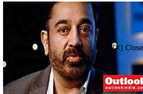
'My Colour Is Obviously Not Saffron, Says Kamal Haasan On Joining Politics'